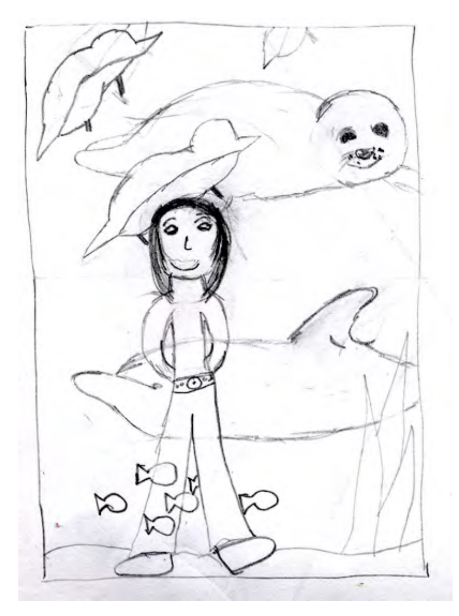
Figure 2. Suzy's self-portrait.

partake individually or collectively in creating an art series expressing their view of human relationships to the social landscape. To carry out an individualized inquiry such as this one in a public school setting, Suzy or the group could approach it as a semester-long independent project guided by the art teacher.