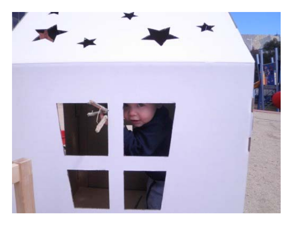
Figure 3. Dramatic play outdoors

Children gravitate to free play, though without challenge engagement may soon wane. Csikszentmihalyi (1997) connects the level of engagement a protagonist experiences with the sense of discovery and creative challenge afforded. Whilst motivated to take up the novel activities on offer, what sustained engagement in the ArtPlay Backyard activities were opportunities to interact, inquire, problem-solve and transform, often collaboratively. Vygotsky's writing links creative experience and play, the latter interpreted as an interactive social form of embodied imagination and imagination in action (Connery, John-Steiner & Marjanovic-Shane, 2010). Imagination is also a core 'source of content' for arts experiences, which as Eisner (2002) states, "not only give permission but also encouragement to use one's imagination" (p. 82). Whether acting out social roles in small cardboard houses, or posting letters to imaginary friends through a bright red door, artful play experiences became a catalyst for imagination, transformation and shared invention.