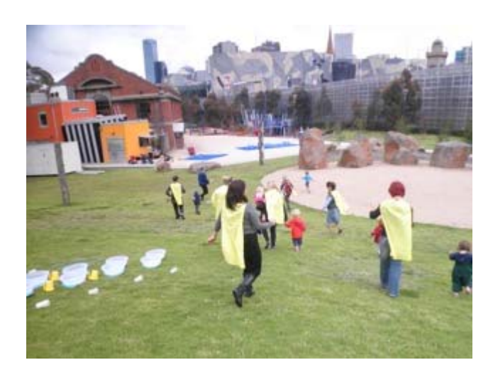
Figure 5. Moving like the wind

look up into the sky to notice cloud shapes and colours. Next, empowered with yellow capes and embodying the feel of the wind, they ran playfully down the hill (Figure 5). Lastly settled on the ground below a raised transparent trough of water, three children gasped and laughed as they looked up at the sky through the movement of brightly coloured tissue paper floating and merging with swirling blue dye. Created by the observing children and added to by others, the ethereal artwork connected them to each other and their surrounding environment. (Researcher observation)