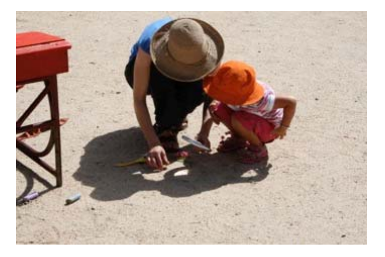
Figure 4. Adults and children noticing together