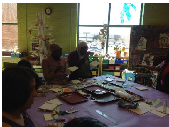
Figure 2. Women in ArtQuest

A new program, LAT was the result of collaboration between GreenHill and a large county child development agency and was funded by a grant focused on the theme of supporting developing economic independence for women and their families. LAT was designed to provide artmaking experiences, to strengthen self-esteem, build community, and encourage entrepreneurship (Figure 2).