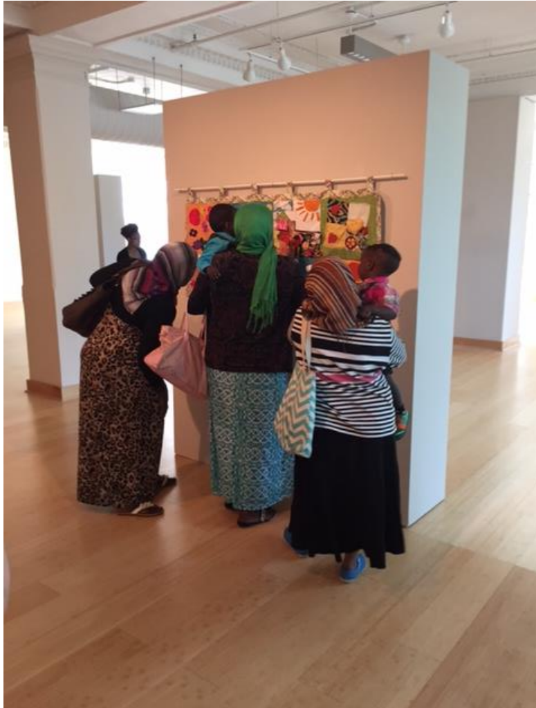
Figure 6. The Exhibition

(Alejandra, transcript, 6-10-15). Later, as artists, the women shared food from their recipes, art, and the cookbook with others in an exhibition at GreenHill. Their art, displayed on white pedestals and pristine walls, was accompanied by the fragrances of spices wafting from the dishes they served, marrying the everyday with the artful and creating an alternative social space that honored their multi-faceted identities as artists, women, and mothers (see Figure 6). While their friends and children attended, their husbands did not.