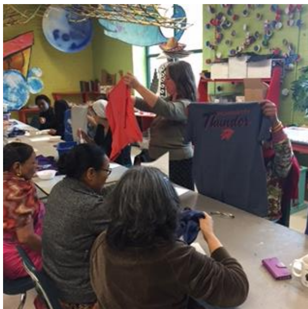
Figure 3. Women working on scarves

One day the women were learning how to make scarves from old T-shirts. Self-segregated, the women from Mexico and El Salvador congregated at one end of a long banquet table while women from Bhutan, Iran, and Vietnam gathered at the other end. Non-stop chatter hung over the room as the women talked while tearing the t-shirts into rolled strands of fabric (see Figure 3).