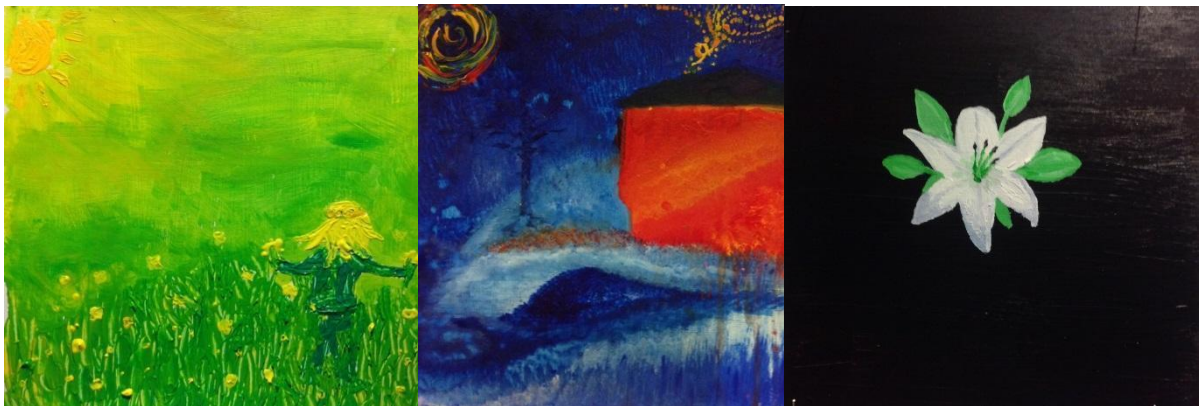
Figure 8, 9, and 10. Visual narratives of three students: significant moments from childhood to adulthood.

The pre-service teachers thought that the entire process widened their understanding in multiple ways. They developed new ideas and perspectives about painting materials and methods as well as on color theory. It made them think about the expressive power of different painting media as well as the significance of the color in artistic expression. The study group formed a learning community where they felt safe and were encouraged to explore through practical stories in a professional way, similar to a traditional fine art apprenticeship community described by Zander (2007). Working through autobiographical storytelling also expanded the pre-service teachers’ understanding of self.