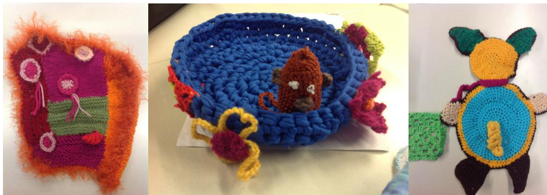
Figure 2, 3 and 4. Pre-service teachers’ artifacts in textile crafts from the ImproStory project.

processes: “It was easier to make ‘contact’ with the yarn when the soul-searching was framed by shared storytelling” (D2: S11).