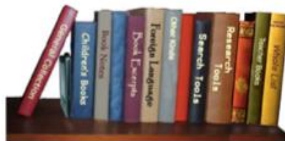
Figure 2. Fiona’s Early Memories of Teacher. (Sources: School books and apple- https://solutions00.files.wordpress.com/2010/01/school_books_and_apple.jpg ; Bookshelf- http://www.drscavanaugh.org/ebooks/libraries/ ).