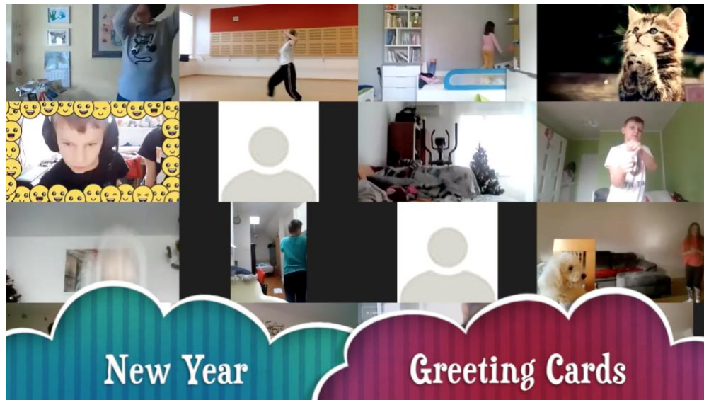
Figure 2. The video "New Year Greeting Cards" was created at the last distance meeting in December. Each child danced their own greeting card, the dancer filmed them via Zoom, and then combined them together into a complete video that became the class New Year's greeting. Video can be viewed at http://www.ijea.org/v23si1/v23si1.5/v23si1.5-video-1.mp4