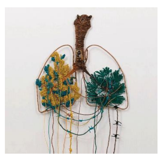
Figure 4. Artworks explored through the Tree Story exhibition.

Note. Brian Martin, Methexical Countryscape Kamilaroi #10, 2017, and Methexical Countryscape: Boonwurrung #1, (installation view), 2021 (Photo: Christian Capurro); Embodied learning with Brian Martin's Methexical Countryscape: Boonwurrung #1, 2021. (Photo: Geraldine Burke); Berdaguer and Péjus, Arbres (Tree) series, 2008. Installation view. (Photo: Christian Capurro); Reena Saini Kallat, Siamese Trees (Man-yan), 2018-19, (Photo: Christian Capurro).