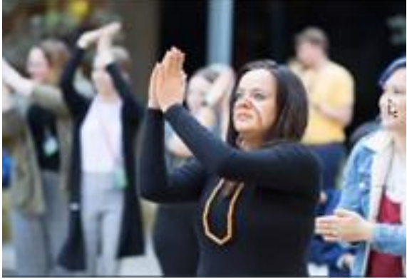
Figure 2. Moving With Cultural Dance and the Wurrung Scar Tree.

Note . The Djirri Djirri dancers, PSTs and children move through dance to connect to tree, animal and Country