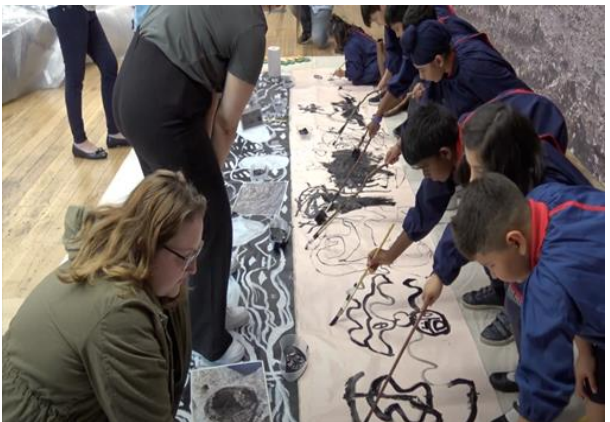
Figure 3. Children Create a Mural Inspired by the Boon Wurrung Culturally Marked Tree

Note . Year 1/2 children and Monash PSTs worked with the Boon Wurrung tree to creatively respond to its ancient rhythms, patterns and carved scars that suggest the making of a shield and coolamon.