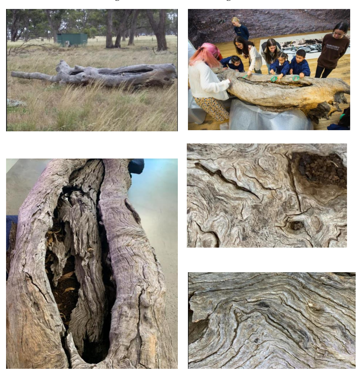
Figure 1. Views of the Boon Wurrung tree on Country, at Tree School, MUMA and Up Close

Note . The culturally marked Boon Wurrung tree was found in a paddock and saved from being burnt and cleared; Exploring the Boon Wurrung tree at Tree School; Participants carefully touched the shape of the marking and wondered what was made from it all those years ago. The children smelt, felt, and examined the patterns and rhythms of the tree's ancient form.